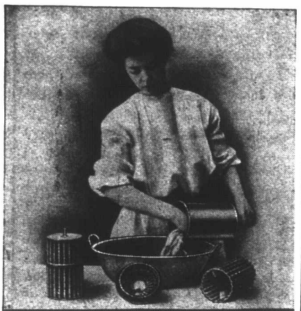
Washed in 15 to 30 minutes.