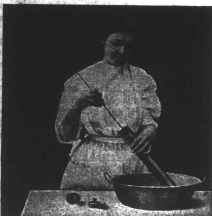
Washed in 1 minute.

One minute with a cloth and brush cleans the absolutely simple Sharples Dairy Tubular Cream Separator bowl shown in the upper picture. It takes fifteen minutes to half an hour with a cloth and something to dig out dents, grooves corners and holes to clean other bowls—one of which is shown in lower picture.