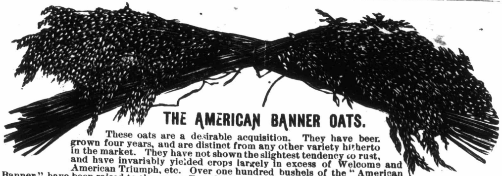
THE AMERICAN BANNER OATS.

Largest Stock in America. and all old and new varieties. Extra Quality. Warranted true. Low- est rates. Introducers of the new Black Grape EATON, T. S. HUBBARD CO., FREDONIA, N. Y.