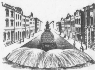
Studebaker Sprinkler (PATENT IMPROVED.)

Because no sweeper so effectually does the work for which it is designed as "The Studebaker." It Sweeps Clean. No sweeper is constructed with the same degree of care and mechanical precision. It Wears Well. "The Studebaker" has the smallest number of working parts, and has less gearing than any other sweeper made. It is free from all unnecessary complications. With reasonable care it does not get out of order. Send for complete descriptive catalogue.