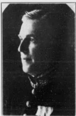
SIR JOSEPH POPE, K.C.M.G., C.V.O., I.S.O. MEMBER OF COUNCIL 1905-17