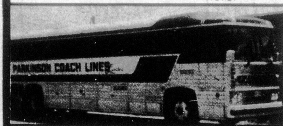
Parkinson's luxurious, climate-controlled coach will whisk you away to Florida with all the comforts of home.

INCLUDES: Gulf & Ocean visits, all accommodations, several meals, full escort throughout tour, Stephen Foster Memorial. Optional side trips; Disney World, Marine Land, Busch Gardens. Optional: Nassau Trip and much more.