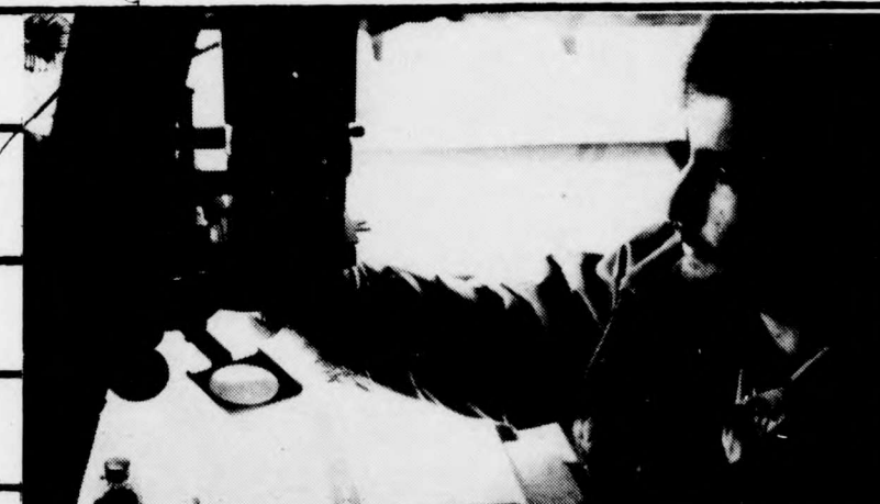
This is the photo editor. All he talks about are cannons, likas, codiaks and nickles.