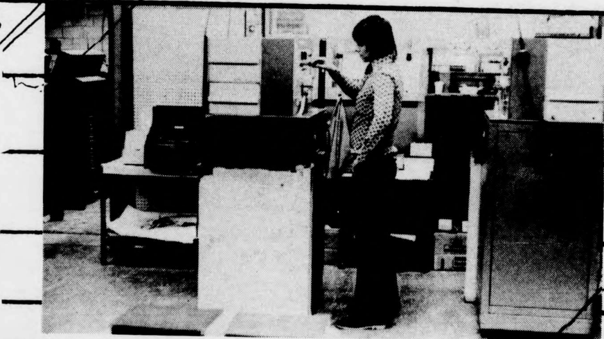
This machine takes the ticker tape and makes it into the print. (I think there's someone inside.)

Yesterday my class went to see how a newspaper is made. We looked at the York Univercity's newspaper, where they make the Excalibur. A funny man with glasses took us all around and showed us how they make a newspaper. After the trip, we had cookies and a wierd brown pop in the newsroom - that's what they call the room where the make all the news. The man told us all about what they do there. Here is what we learned.