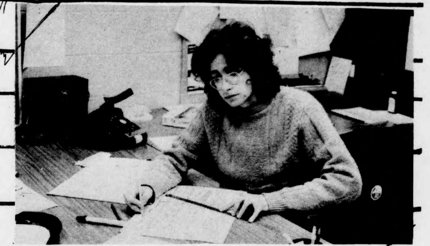
This is the layout man.

Anyway, he gets someone to type out all the things of the paper again, but onto ticker tape that is made into columns in a computer. Then the tapes are pasted onto flats. The headlines are done the same way only bigger. Then Mr. Newsweb takes a picture of the flats and gives the negative of the picture to his friend who works there too. They put the negative on a sheet of metal and make it burn into this big metal plate so that they can print out the newspaper with it.