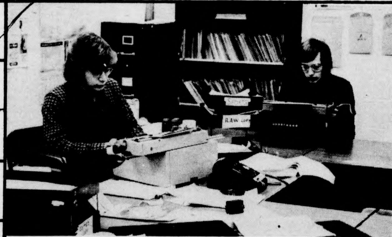
This is the staff who make the sports. one has fuzzy hair and the other drinks brown pop.

Another thing that's always going on is the people who go out and take pictures of everything. The pictures are part of the news too, and there are a whole bunch of people who do them.