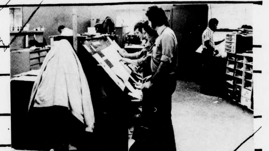
These guys are the pasties. They do paste-up. They always yell at the editors.