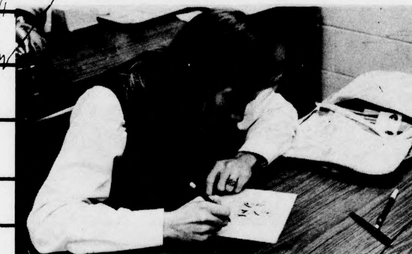
This is the cartoon man. He draws good.

The papers are then tied into neat buddles and left at the doors of the Ross building and Founder's college. Some of the people from the Excalibir office go and take the bundles and put them into the nice red boxed and then everybody gets to take one and read it and find out all about the news that's going on.