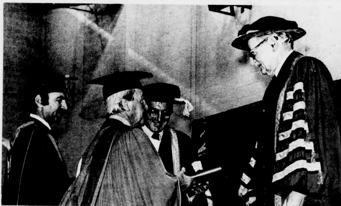
Henry Moore, renowned sculptor who designed the "Archer" for Nathan Phillips Square at Toronto's City Hall received an honorary Doctor of Letters Degree at Fall Convocation last Saturday. Mr. Moore is

5:35 p.m. — 7:50 p.m. — "Summerhill" — although a Humanities class, extra seating available — Room I, Curtis Lecture Halls.