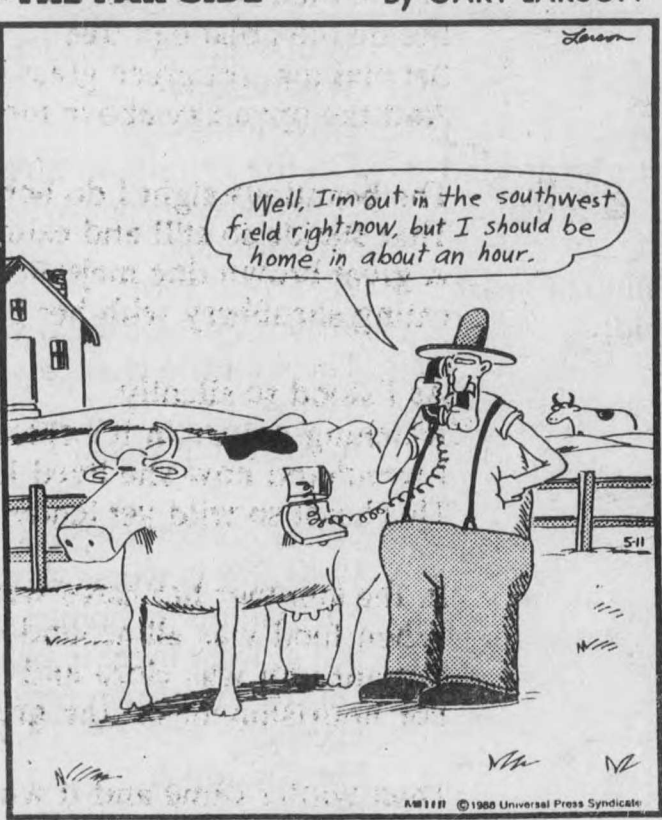
The rural professional and his cowphone