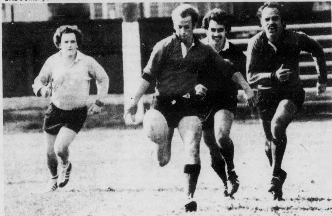
Laying the boots to it.

Tomorrow both teams will be looking for victories over clubs they've lost to before. At 2 o'clock the Reds meet the Exiles at Fredericton Raceway, and at 4 the Blacks are at home to the Loyalists on College Field.