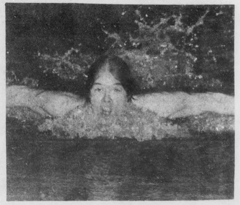
BROWN had a fair share of the national contenders on this season's Beavers.

Brown said that the Beavers plans possibly included the Commonwealth Games to be held in looking for the Beavers to show a summed up the Beavers pilot.