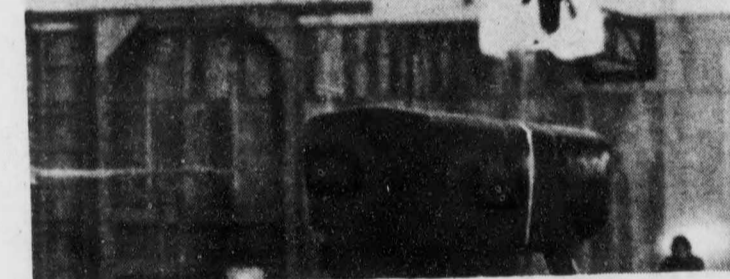
THE FLIGHT - One of the weekend competitors is shown in mid-air during the meet hosted by UNB.