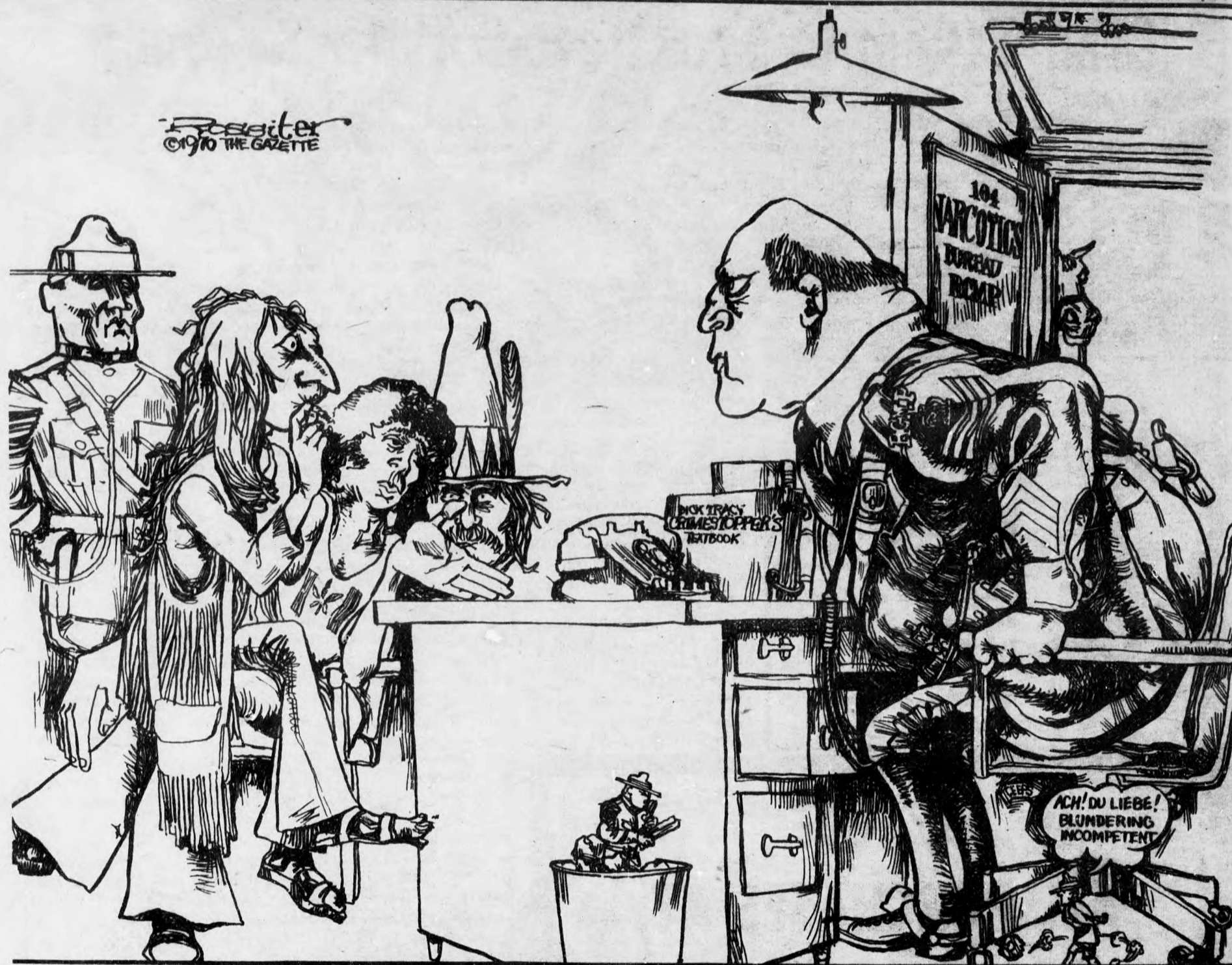
Sorry, Chief. We couldn't even get into Anthropology. Wanna toke?