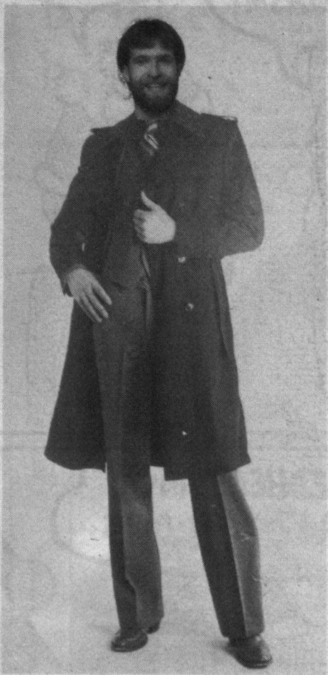
In the Home

This elegant outfit is perfect for lounging around the house reading a book or just watching TV with the family.