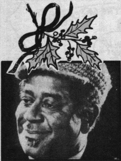
Living legend DIZZY GILLESPIE Saturday, January 15 at 7:30 and 9:30 PM