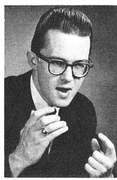
NFCUS PREXY COMING -

They further suggest that at the next congress of the two organizations, a report by the joint commis-sion and establishment of the new superstructure and a report on Confederation studies be considered.