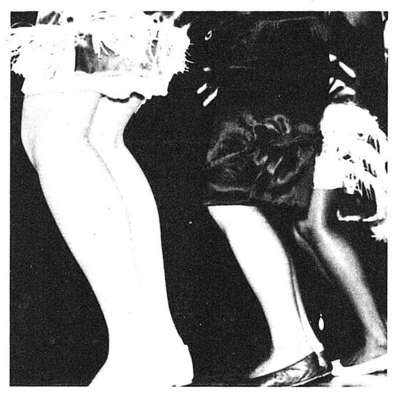
AMERICAN BEAUTIES? Stems on display at the Joe College Dance. Can you tell a rose by its stem?

10h 15 2h 15 Mardi le premier 7h 15 octobre Mercredi le 2 7h 15 octobre Vendredi le 4 7h 15 octobre See Short Shorts for translation.