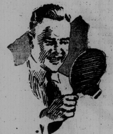
Look in Ten Days

That film, to some extent, clouds nearly every set of teeth. And most tooth troubles are now traced to it.