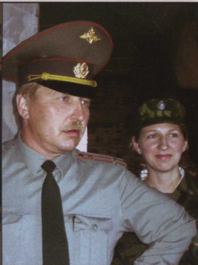
Russian military officials