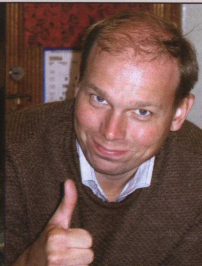
Russian shipyard manager