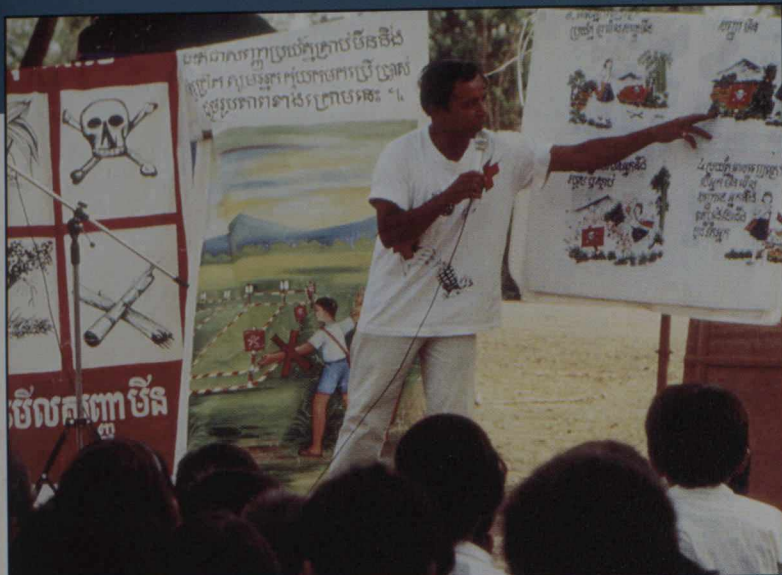
A mine awareness educator in Cambodia teaches a community about the dangers of anti-personnel mines.