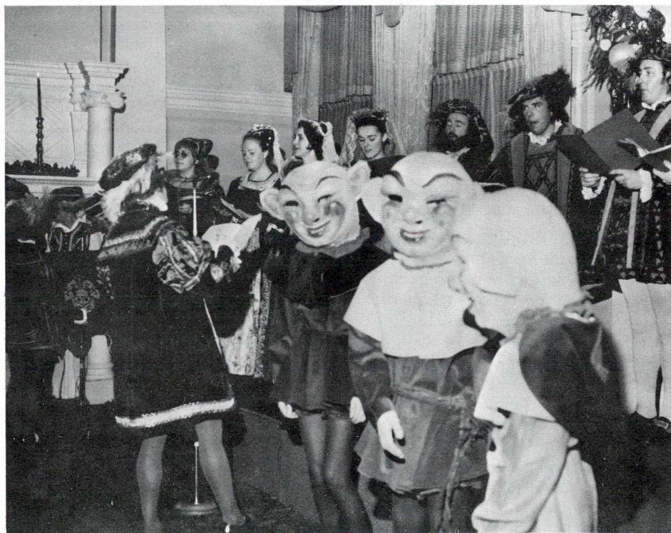
Madrigal singers entertain guests at the Empress Hotel, Victoria, B.C.

The traditional dinner on January 6, Christmas eve, is known as sviata