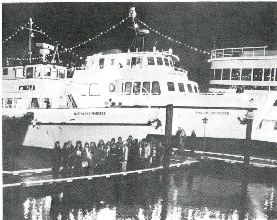
Vancouver's decorated "carol ship" prepares to spread the Christmas spirit.

and pyrophy (cooked dough with sauerkraut filling).