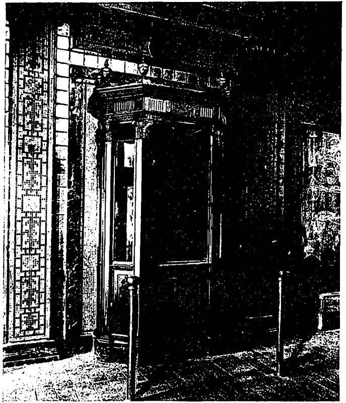
BRONZE TICKET BOOTH, ST. DENIS THEATRE, MONTREAL.

The central portion of the main ceiling is pierced by a dome forty feet in diameter, painted a deep soft blue, enriched with zodiacal signs and glittering stars in gold, and the balance of the geometrically designed ceiling is in white, here