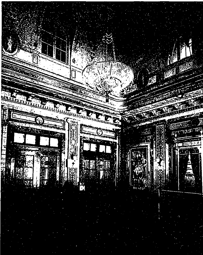
VESTIBULE, ST. DENIS THEATRE, MONTREAL.

Over the proscenium arch in the covered panel