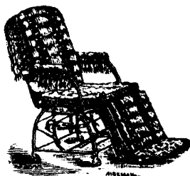
Library, Smoking, or Reclining Chair, Lounge and Bed.

The most comfortable Chair to be had. No house is complete without one. A beautiful piece of furniture, combining in one a Chair, Lounge and Bed; richly upholstered with good materials. Will fold into a small compass and easy to transport. By reason of our improved machinery and skilled workmen we offer the Chair for $30 complete. Send for Illustrated Catalogue.