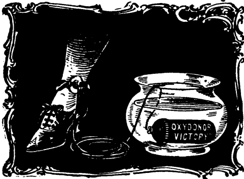
(Trade-mark Registered Nov. 24, 1896.)