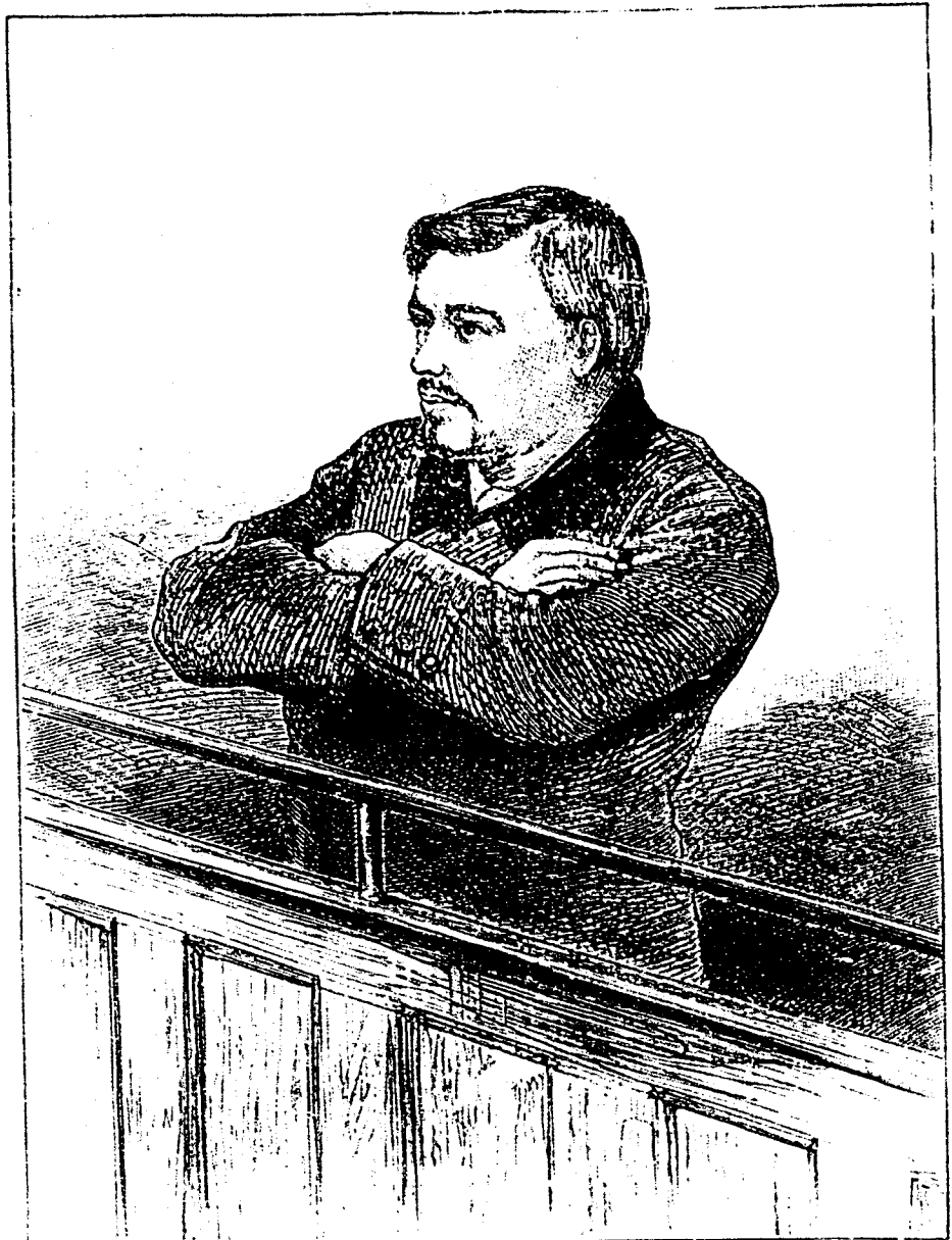
JOSEPH BRADY, SENTENCED TO BE HANGED FOR THE MURDER OF LORD CAVENDISH AND MR. BURKE.