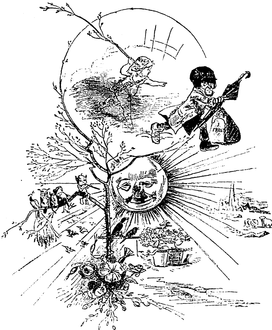
THE DEPARTURE OF WINTER.