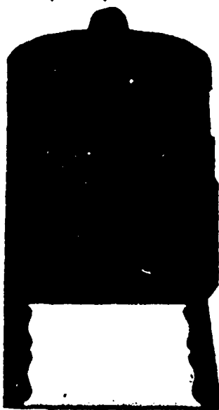
The Brown Bros. Limited.

THE Joseph Dixon Crucible Co. of Jersey City, N.J., are getting out neat little blotter pads with one side glazed and a monthly calendar printed thereon. The pads are very handy and are intended to