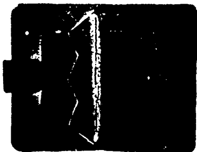
The Brown Bros. Limited.

Raphael Tuck & Sons are, through their Canadian representatives, Warwick Bros. & Rutter, Toronto, making a new departure that has for its object the bringing before the public notice of their Christmas and