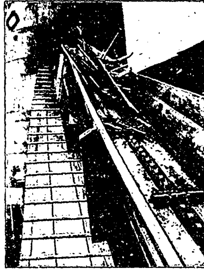
JEFFREY REFUSE CONVEYOR.

THE JEFFREY MFG. CO., - Columbus, Ohio, U.S.A.