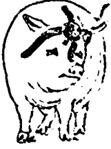
The "Stunner." Humaniarians should use and advocate the use of the "Stunner."

Highly Commended at the Toronto Exhibition 1885.