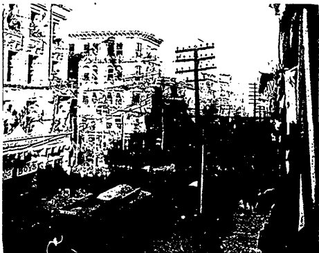
SCENES IN TORONTO WHEN THE BOYS CAME HOME FROM SOUTH AFRICA: LOOKING UP KING STREET EAST FROM CORNER OF YONGE STREET.

of these we submit a couple of views of the return of the Toronto boys which will give some idea of the enthusiasm aroused. And what happened in To-