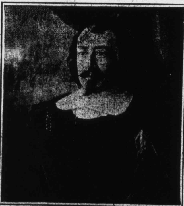
GENERAL DE CHAMPLAIN.

For sale by the Stothart Mercantile Co., Ltd.