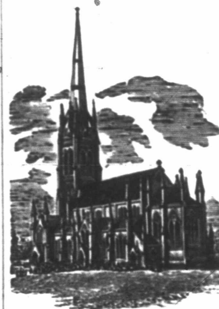
St. James' Cathedral, King St., Toronto, contains 500,000 cubic feet of space and is successfully heated with four of our Economy Heaters.