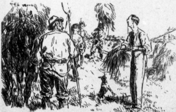
"HELP" FROM THE CITY

Power equipment—tractors and gas engines, with the machines they operate; silo fillers, threshers, cream separators, electric lighting plants, saw rigs, corn huskers, corn shellers, etc.—is revolutionizing farm life to-day. It is marking a new era in the evolution of our agricultural life. It is making work on a farm attractive to the average and above the average man and maiden. Business methods are recognized as essential to proper efficient operation, and with business methods and mechanical machinery to attract the enterprising, the trend of labor is now rather from the city to the farm than otherwise. It is the opportunity