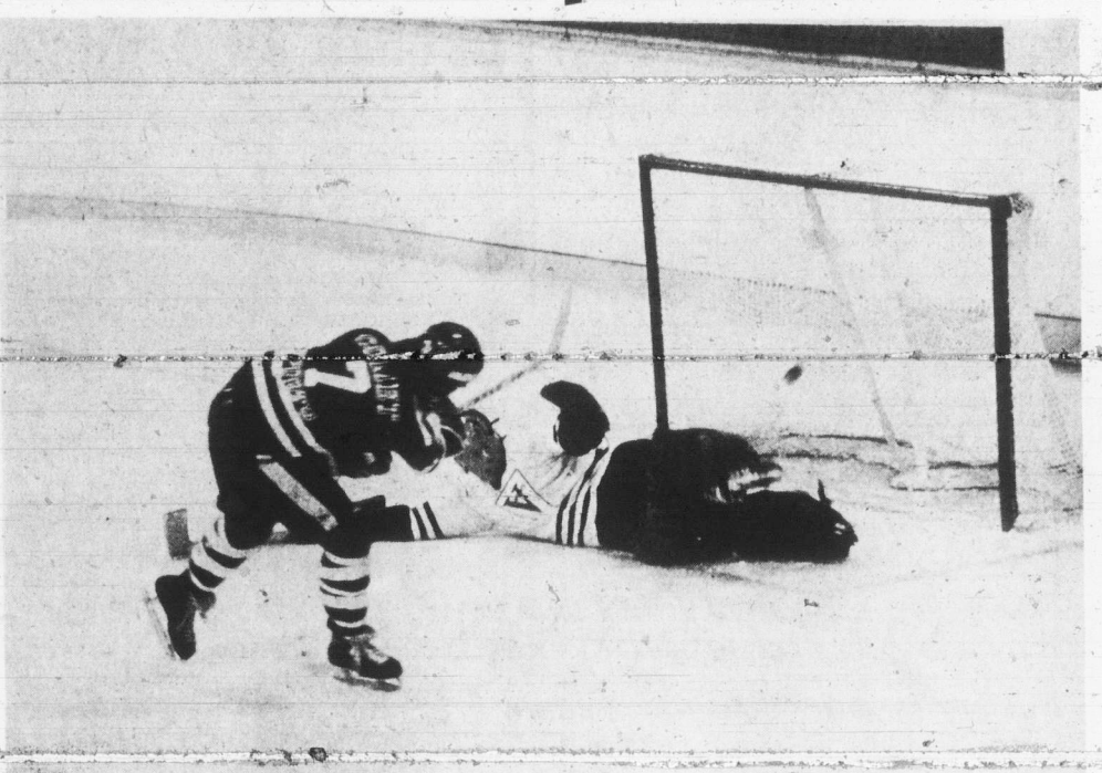
Breakaways were the order of the night as Oakville Blades connected on six third period free chances and dumped host Dixie Ventures 14-6 in a wild Central Ontario

Ventures host Brampton tomorrow night at Dixie Gardens beginning at 7:30 and travel to Burlington Saturday and Streetsville Sunday.