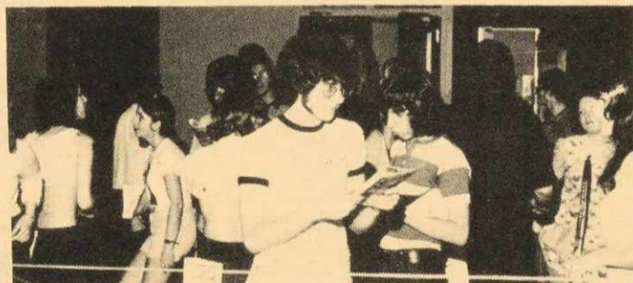
Some of the marathon dancers who helped raise $1700