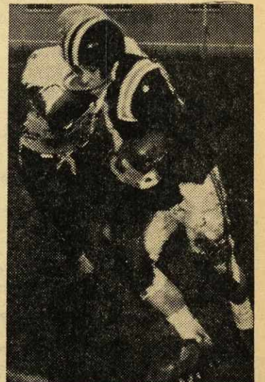
"Let go will ya" seems to be what the Dal player is saying to the Mt. A player

a big step on the road to success is an early banking connection