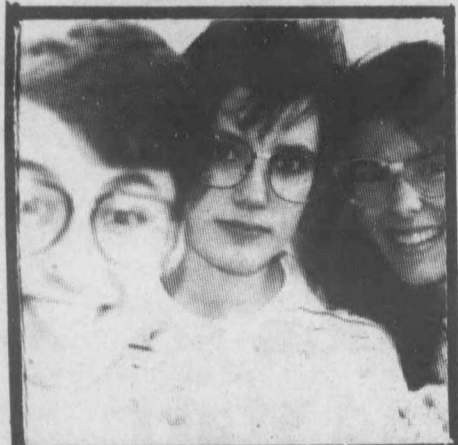
The Physics geeks BSc 1-4 Lab Tours.