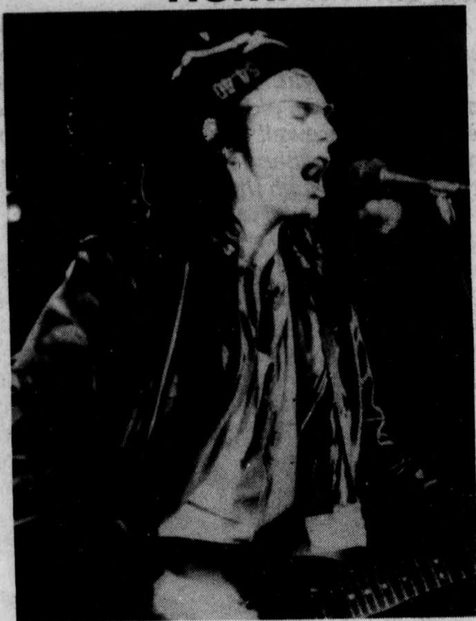
"Damn! I've just swallowed my chewing gum!" -- 54.40 ham it down.