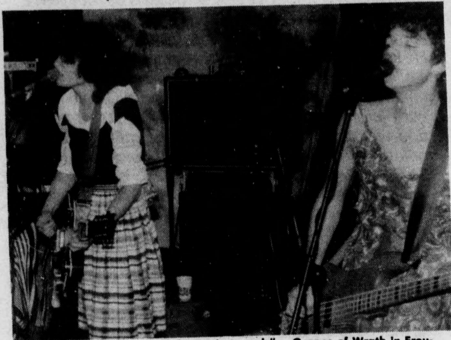
"Frankly sweetie you look better in tweeds" -- Grapes of Wrath in Freudian mayhem shock!