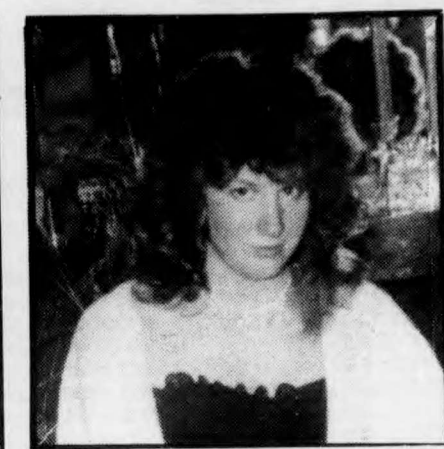
A lion. I love how they Purr just before they bite.