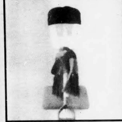
"ME" BBA II Digger the shovel Scooping I