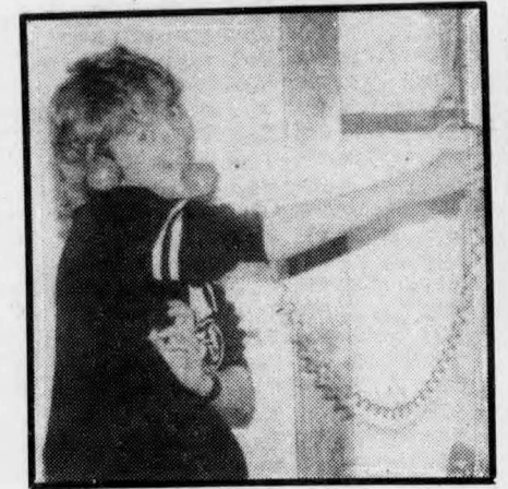
I don't care what it is, as long as it has a phone attached.