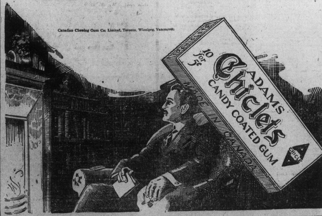
Canadian Chewing Gum Co. Limited, Toronto, Winnipeg, Vancouver.

—an Adams product, particularly prepared