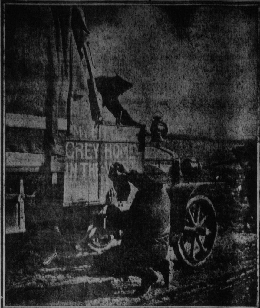
A "LITTLE GRAY HOME IN THE WEST" ON A ROAD IN NORTHERN FRANCE. The familiar London buses used by the army authorities, which was hit by a torpedo from a German submarine, is a fact which calls forth the above inscription on the side of the conveyance. "The Little Gray Home in the West" is a song that has become popular with English audiences, both in Great Britain and in the western fighting line in France.