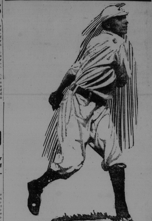
"BIG CHIEF" BENDER.

"Big Chief" Bender of the Athletics is counted upon to win his game, or possibly his games, when the Quakers meet the Cubs in the post-season series for the big money. Bender is not being worked often by Mack, who, with the pennant in his pocket, is taking no chances with a valuable asset. Bender is not a powerful man, and cannot stand the strain of continuous pitching, as Coombs and Morgan have. Whenever he is trotted out, however, the odds lengthen on the Athletics. Bender is the only Athletic pitcher to win his game against the Giants in the post-season series of 1905, and he is a better man today than when he broke the string of shutouts McGraw's tribe was hanging up against the hope of the American league.