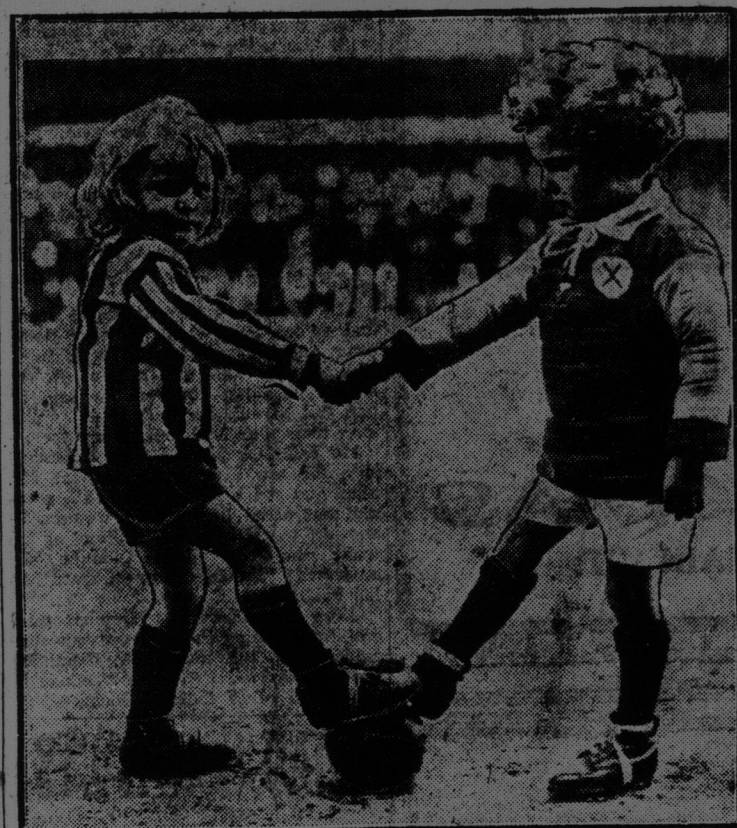
The tiny mascots of the football teams of West Ham and Notts County greeting each other in the conventional manner before the opening of the game.

Price 25c a vial at all dealers or mailed direct on receipt of price by The T. Milburn Co., Limited, Toronto, Ont.