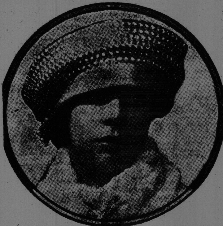
A new portrait of Virginia Valli, film star.

Complaints have come from time to time to the Board of Health since the pasteurization of milk has been made compulsory, that the baby will not drink it, the supposed reason being a been heated by her, and invariably heat. We wish to advise that this is largely the imagination of the mother, for the reason that since the world began to be civilized and an infant was fed upon milk other than the mother's, it has been heated by her, and invariably heated to a higher temperature than that used in scientific pasteurization. It is the high temperature that will cause the change in flavor. Physicians under certain conditions of the health of the baby will order milk to be boiled. Does the baby object to the change in flavor caused by boiling if the doctor order it? No. It is considered by the mother as a correct food for the child, and no particular notice is taken as to whether the child likes it or not. Why should the infant object to scientifically pasteurized milk, as done in an up-to-date milk plant, when they do not object to milk heated, trebled and