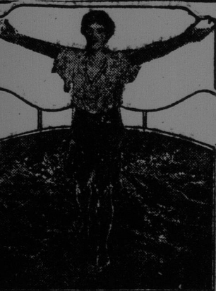
"MONTE CRISTO" WALTER FOX SPECIAL PRESENTATION

Selected from among all the theatres in the Dominion for the honor to show for the first time in Canada— The Screen Sensation of the Year