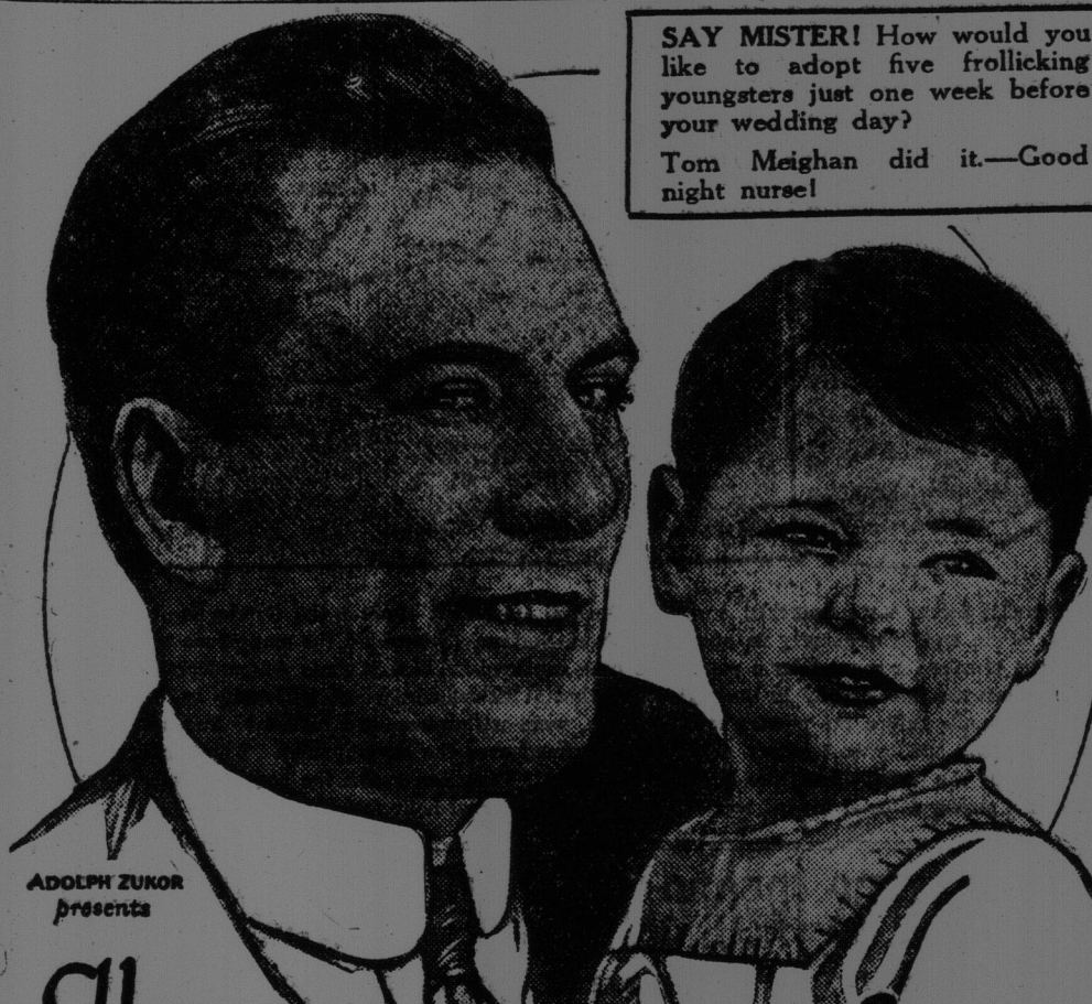
ADOLPH ZUKOR Presents