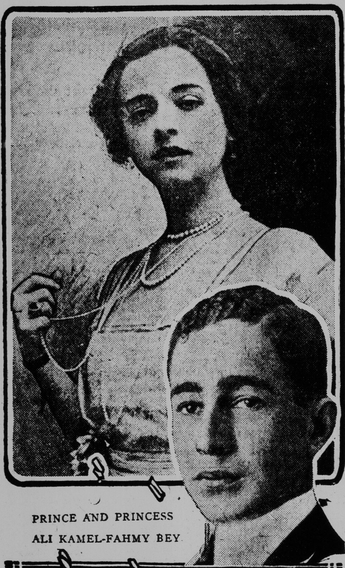
PRINCE AND PRINCESS ALI KAMEL-FAHMY BEY

London, July 27.—A verdict of murder has been returned against the beautiful Princess Ali Kamel-Fahmy Bey, a Frenchwoman, accused of shooting to death her royal Egyptian husband in their luxurious suite at the Savoy Hotel, London.