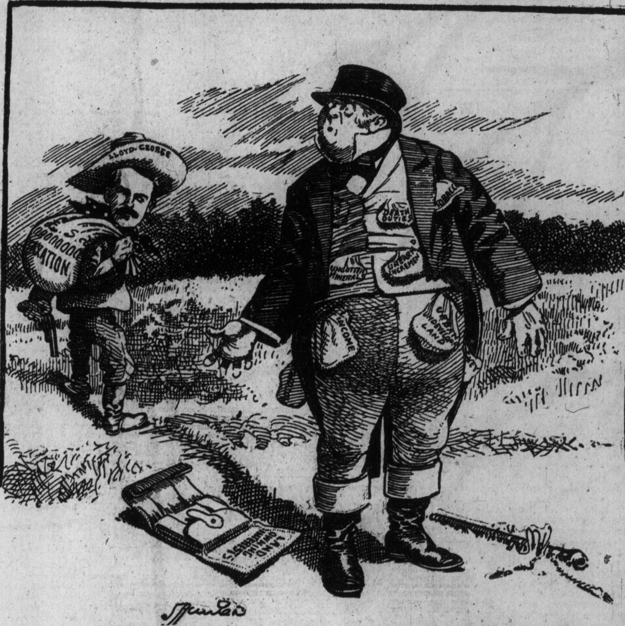
THE VICTIM: 'Twas Jolly Lucky I had No More Pockets