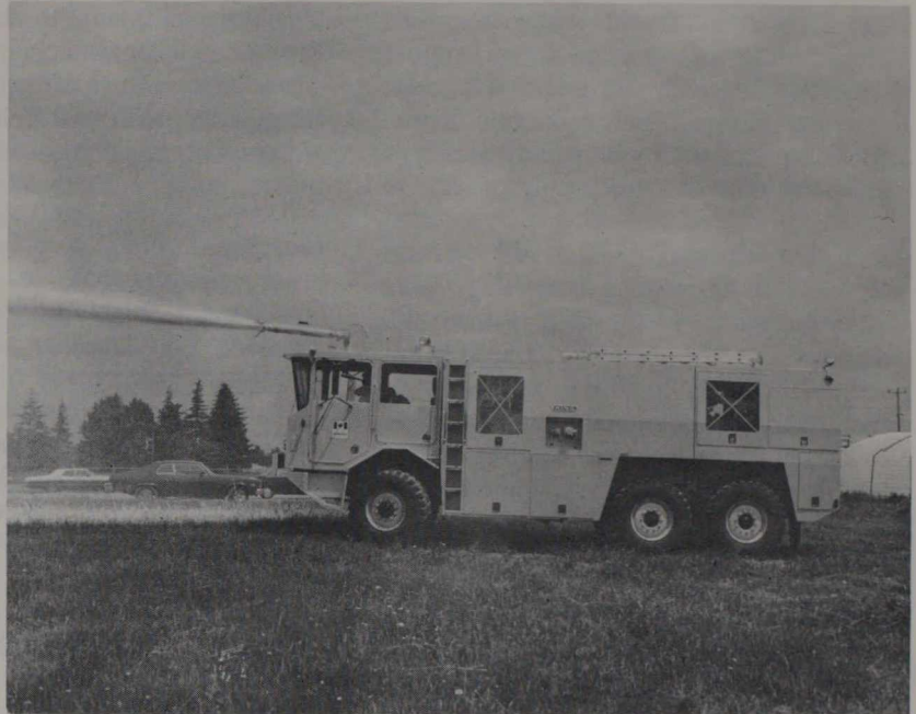
Produced for and delivered to the Indonesian Government, this crash foam truck will provide protection for both aircraft crash and fuel spill fires in Indonesia. It is just one example of the many types of fire fighting units manufactured by King Seagrave Limited of Woodstock, Ontario.

Innovative, safe and reliable, and whether for use as prime movers for bulk transport, other heavy duty applications or just for fun, these pieces of equipment are designed with one thing in mind: to do the job and get it done economically and efficiently.