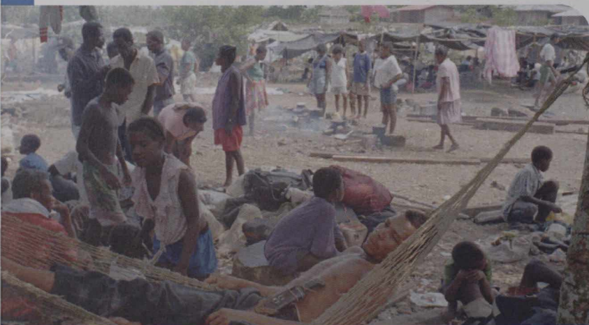
Refugee camp of Pavarando, about 500 miles north of Bogotá, Colombia. Thousands of peasants have fled here to escape from violence between leftist guerrillas, right-wing paramilitary fighters and the military.

Across the Hemisphere, free and fair elections—once rare occurrences—are now commonplace events. The past decade has seen much further progress in developing democratic systems. There have been occasional challenges and temporary setbacks, but they have merely shown how strongly entrenched democracy is in the Americas today. Look, for example, at how the OAS helped Peru deal with a crisis to that country's democracy in 2000.