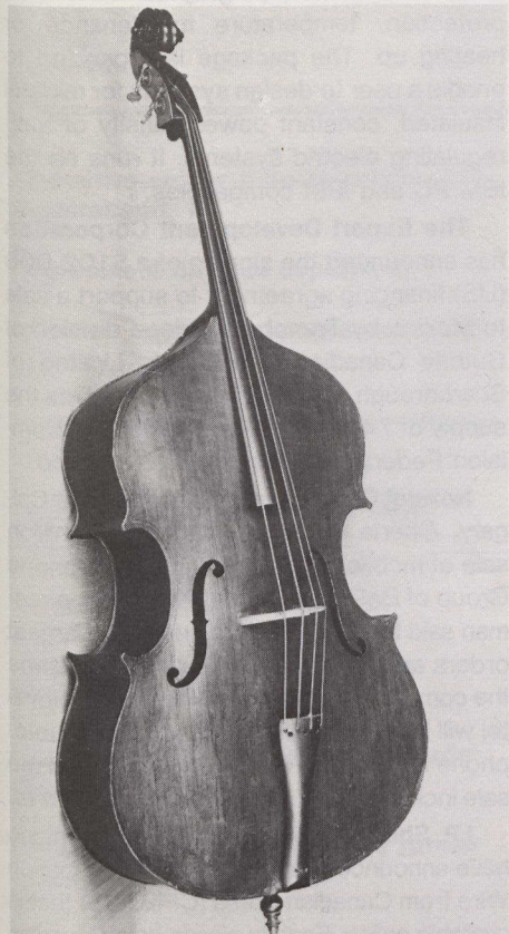
Double bass from Italy, c. 1600, attributed to Casparo Bertolotti da Salo.

The Royal Ontario Museum (ROM) in Toronto, Ontario has opened a new musical instruments gallery to display its outstanding collection of historical musical instruments.