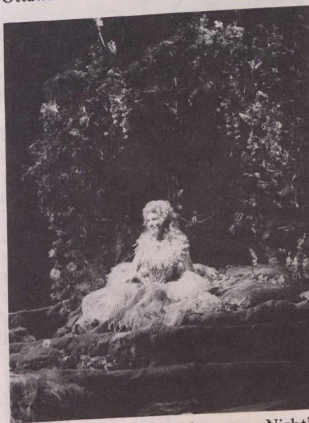
A scene from A Midsummer Night's Dream .