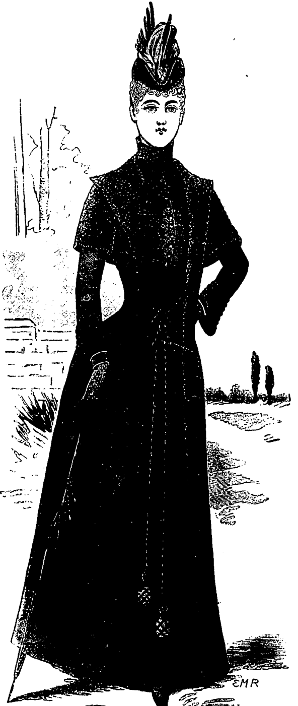
FIG. 32. No. 4412.—LADIES' COAT. PRICE 30 CENTS.

Quantity of material (42 inches wide) for 10 inches around muscular part of arm, \frac{3}{4} of a yard; 11 inches around muscular part of arm, \frac{3}{4} of a yard; 12, 13 inches around muscular part of arm, 1 yard; 14, 15 inches around muscular part of arm, 1\frac{1}{4} yards.