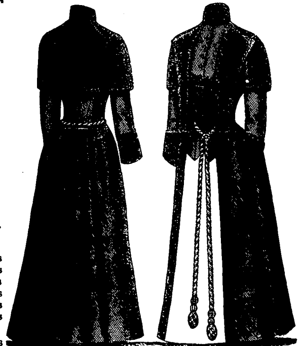
FIG. 34. No. 4412.—LADIES' COAT. PRICE 30 CENTS.

If made of materials illustrated, 3\frac{3}{4} yards of 54-inch goods and 2\frac{1}{2} yards of 27-inch plush will be required to make the medium size.