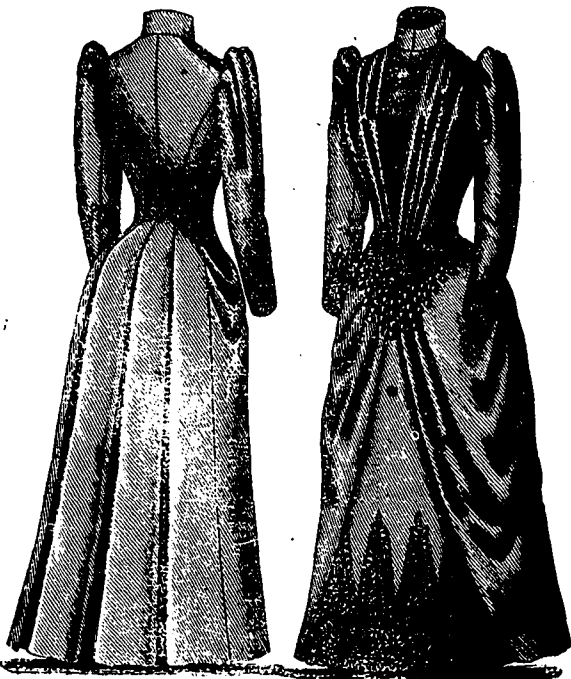
FIG. 37. No. 4389.—LADIES' COSTUME. PRICE 35 CENTS.

This design cuts from 30 to 40 inches bust measure, and the quantity of material required for each size, of 42-inch goods, 7\frac{1}{4} yards, or 54-inch goods, 5\frac{1}{2} yards. If made of materials illustrated, 4 yards of 54-inch material, 5\frac{1}{2} yards of velvet and 11\frac{1}{2} yards of fur trimming will be required to make the medium size.