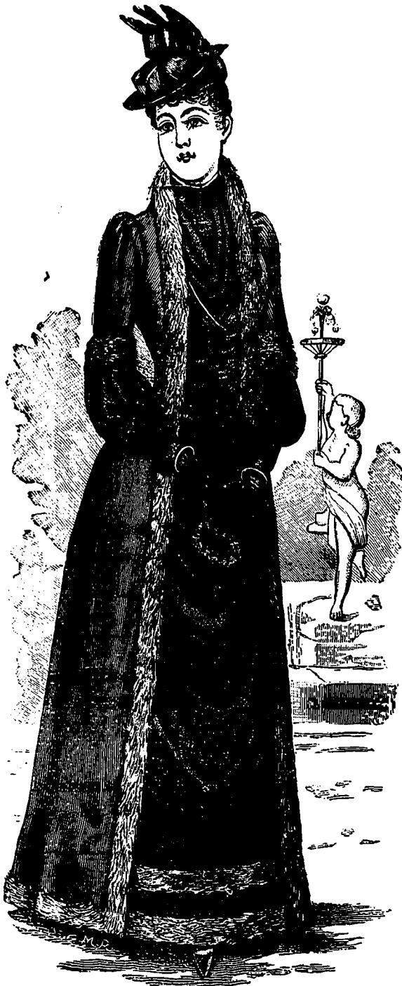
FIG. 31. No. 4411.—LADIES' COSTUME. PRICE 35 CENTS.

This design cuts from 30 to 40 inches bust measure, and the quantity of material required for each size, of 42-inch goods, 7\frac{1}{4} yards, or 54-inch goods, 5\frac{1}{2} yards. If made of materials illustrated, 4 yards of 54-inch material, 5\frac{1}{2} yards of velvet and 11\frac{1}{2} yards of fur trimming will be required to make the medium size.