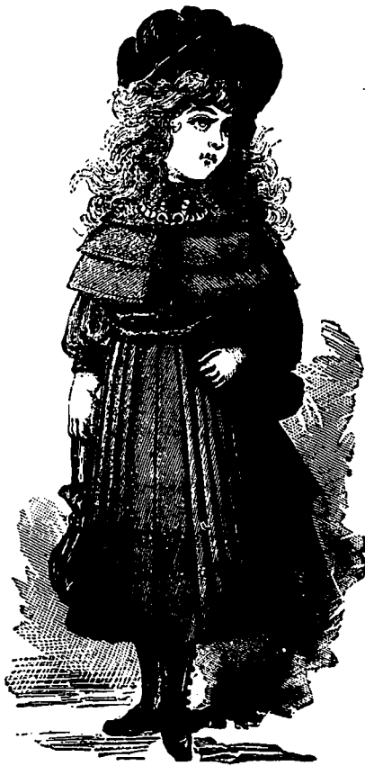
FIG. 51. No. 4415.—GIRL'S COAT. PRICE 20 CENTS.

Wide trimming for skirt, 1\frac{1}{2} yards; narrow trimming, 1\frac{1}{2} yards.