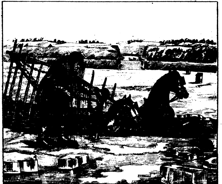
INCIDENT ON BURLINGTON BAY