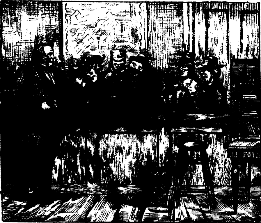
HAMILTON.—SKETCH IN THE REGISTRY OFFICE AFTER A MARRIAGE LICENSE