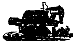
THE WOODBURN IMPROVED Pulverizer.

At his old stand, Commissioners Street, Cor. St. Sulpice, (HAS NO BRANCH STORE.) All kinds of Canvas Goods. Tents holding from two persons to 10,000. All kinds of Tackle Blocks, Rope, Pitch, Tar and Oakum. Canvas folding Bouts, Skiffs, Canopy Hammocks, etc. Everything made to order promptly.